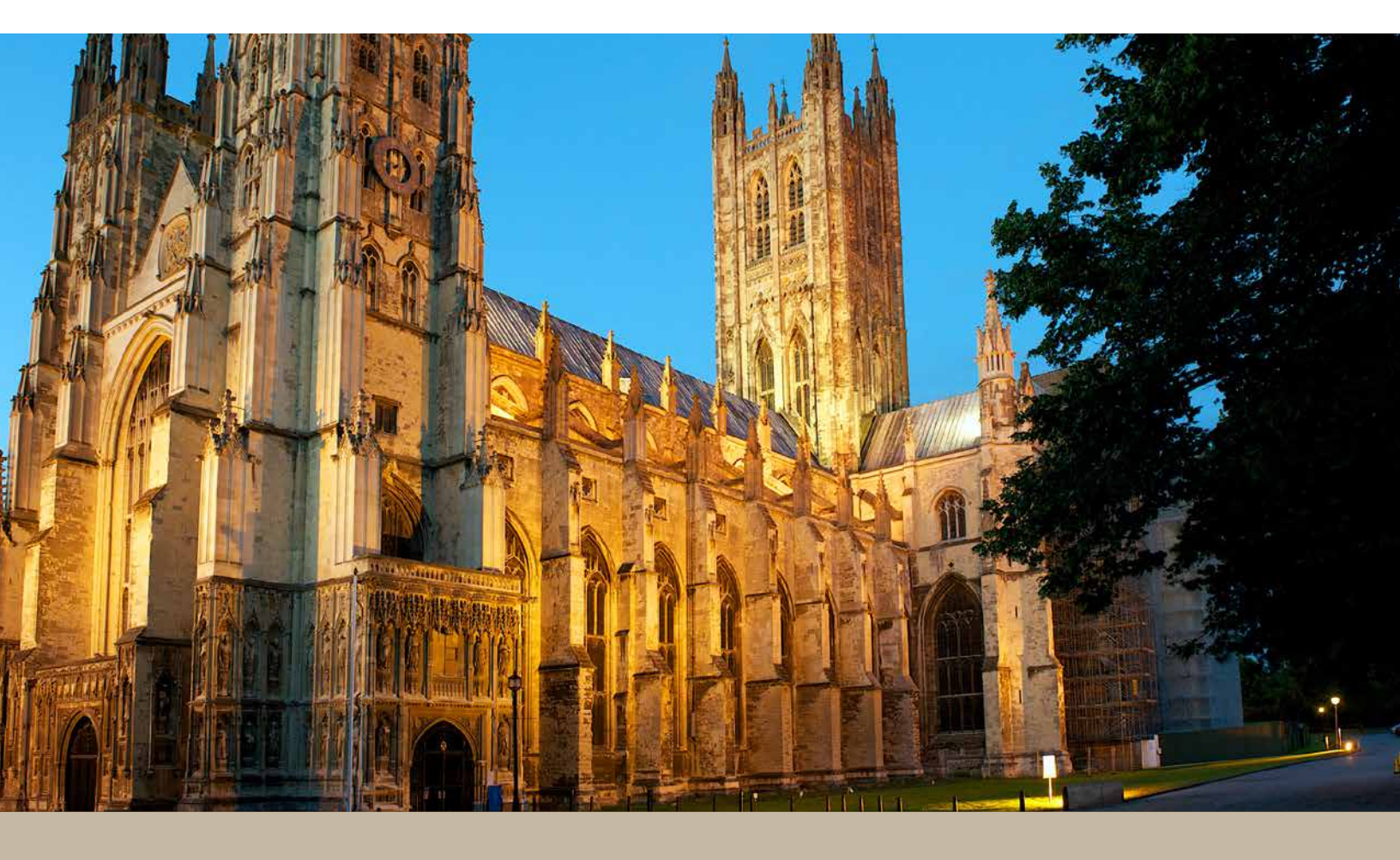
A PILGRIMAGE FOR THE EPISCOPAL DIOCESE OF MAINE